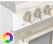
F4EDF366BR1-RAL RAL CODE