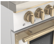
F4EDF366BR1-MW MATTE WHITE RAL 9016