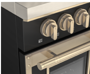
F4EDF366BR1-MB MATTE BLACK RAL 9004