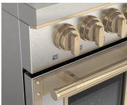
F4EDF366BR1-SS STAINLESS STEEL