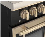
F4EDF366BR1-BK GLOSSY BLACK RAL 9004