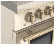
F4EDF366BR1-MI MATTE IVORY RAL 1015