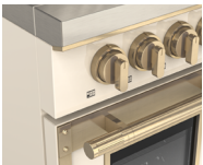
F4EDF366BR1-IV GLOSSY IVORY RAL 1015